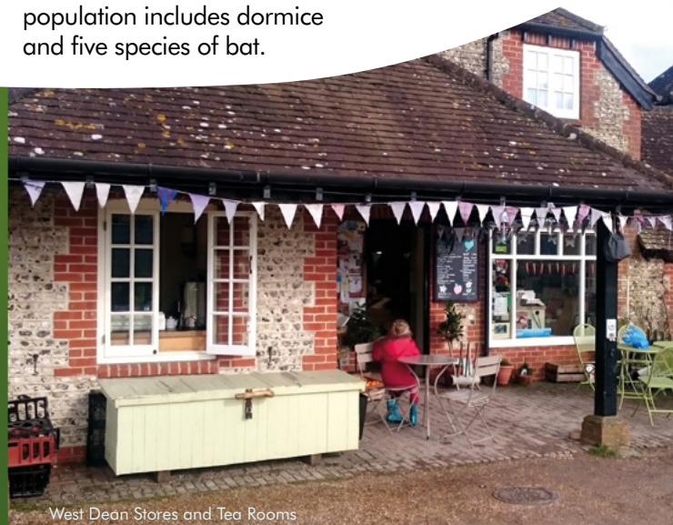
West Dean Stores and Tea Rooms