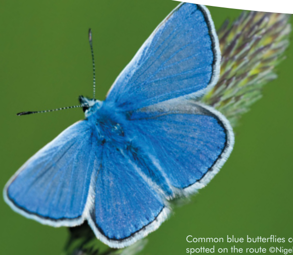
Common blue butterflies can be spotted on the route ©Nigel Symington

SDNPA/The Way Design/April 2018. © SDNPA Crown copyright